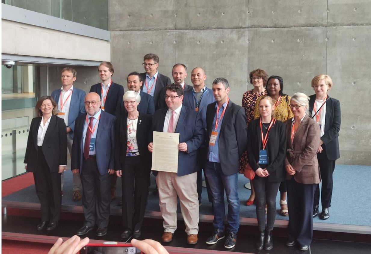
Fig. 4. Ceremonial signing of the European Declaration on Engaged Research with City and University representatives from across the UNIC the European University of Post-Industrial Cities. In the joint declaration they commit to develop a common approach to engage citizens, communities and their cities in promoting research and innovation. This declaration is part of the UNIC4ER (UNIC for Engaged Research) project funded by the European Commission.