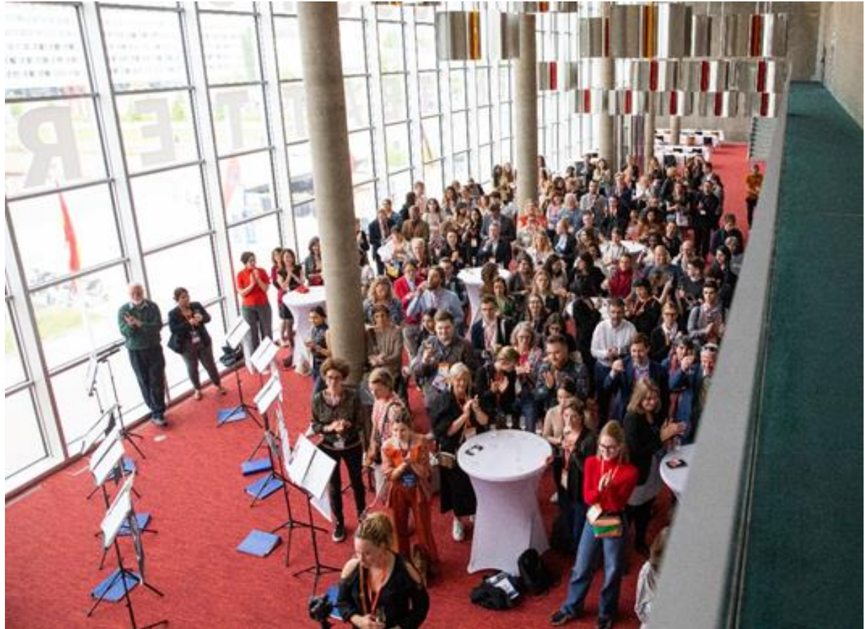
Figure 5. UNIC CityLab Delegates in attendance for the opening ceremony of the CityLab Festival and signing of the European Declaration on Engaged Research with City and University.